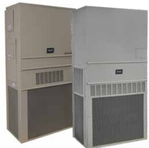
Wall-Mount™ B-Cabinet Heat Pump