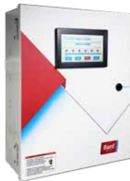
MC5300 & MC5600