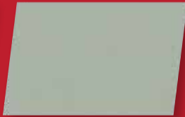
4 = BUCKEYE GRAY