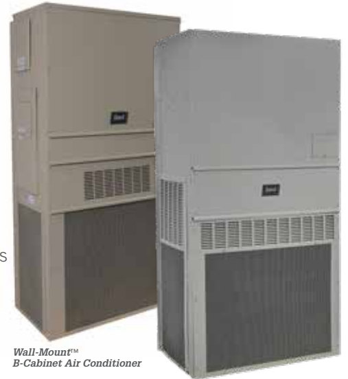
Wall-Mount™ B-Cabinet Air Conditioner