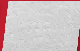
A = ALUMINUM