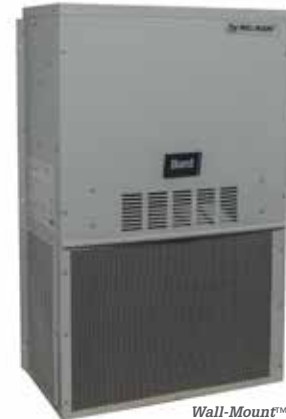
Wall-Mount™ 1 Ton Cabinet