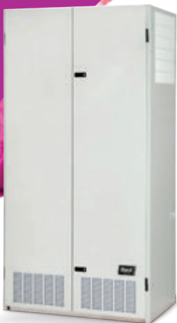
IH SERIES Heat Pumps

The I-TEC is an interior model that provides superior indoor air quality and the ultimate in quiet operation. Vented above the sill at window level, it's designed to blend in with exterior features.