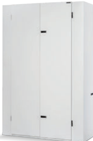
IZ SERIES Heat Pumps