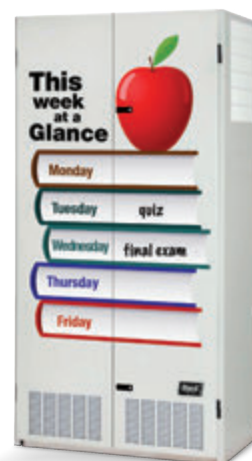
IA SERIES Air Conditioners